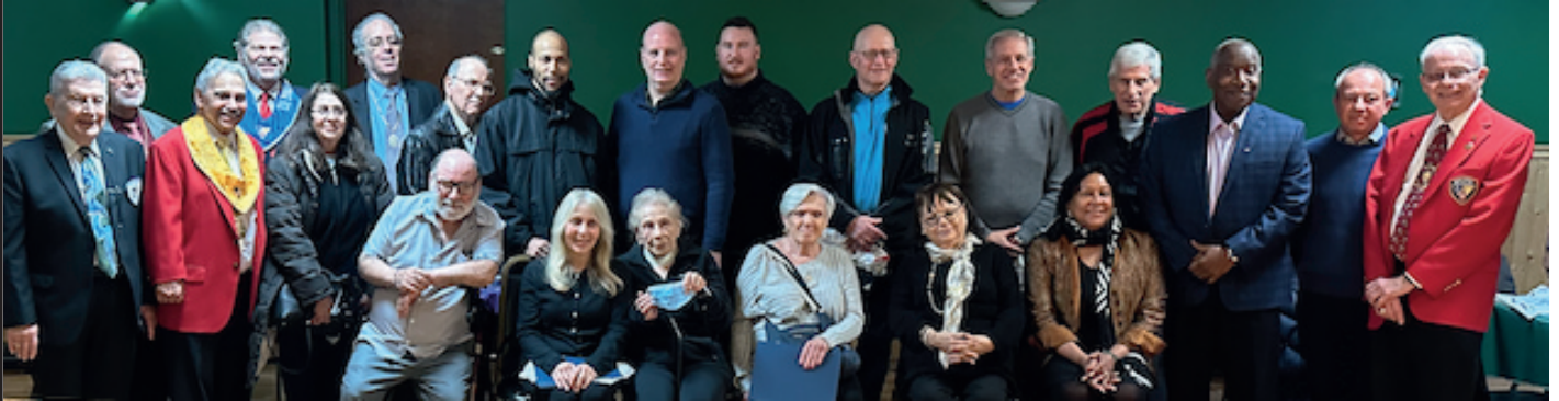
[Pictured above Ritual Team member and new knights. ]